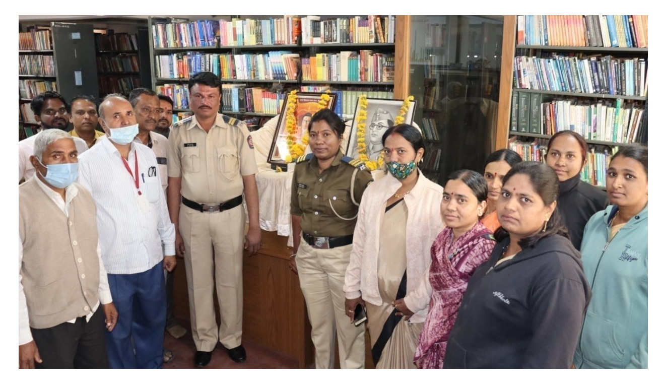
Non-Teaching staff & employs of police department participated in jayanti program.